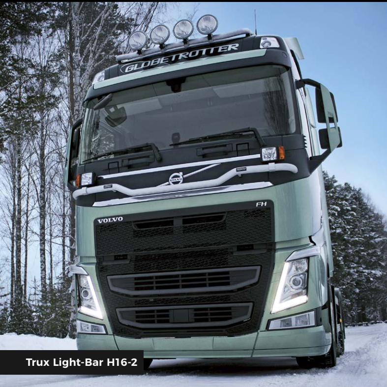
Trux Light-Bar H16-2