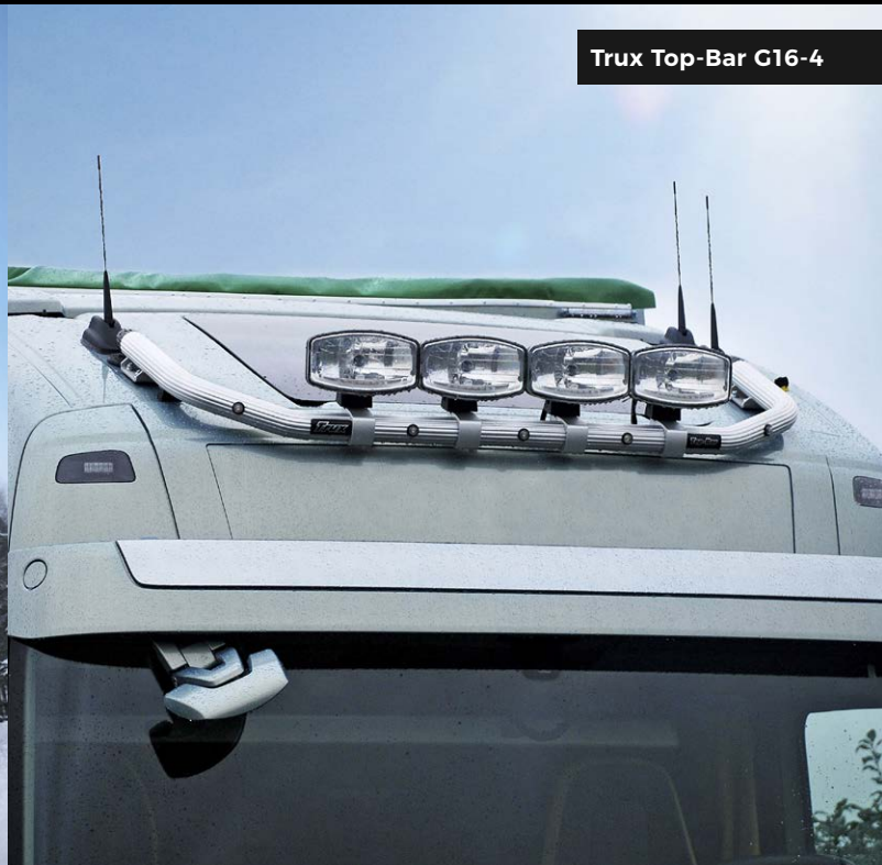
Trux Top-Bar C16-4