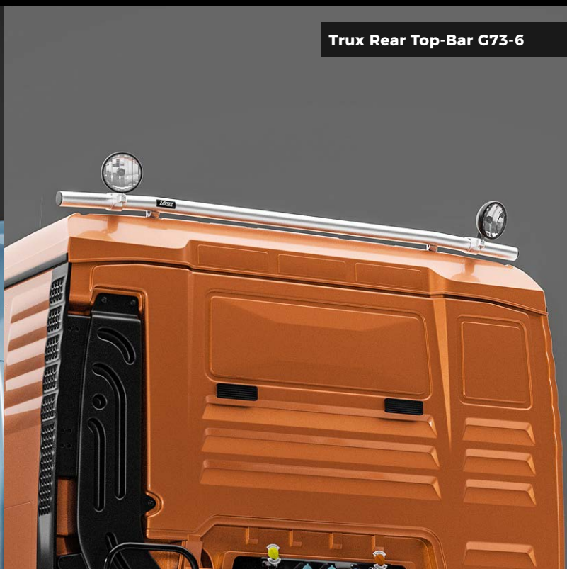
Trux Rear Top-Bar G73-6