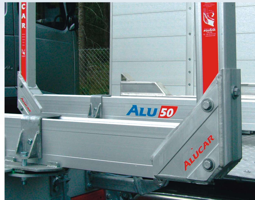
Secure bolted fitting of stakes on bunkframe